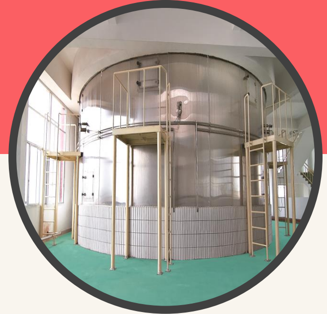
SPARAY DRYING TOWER