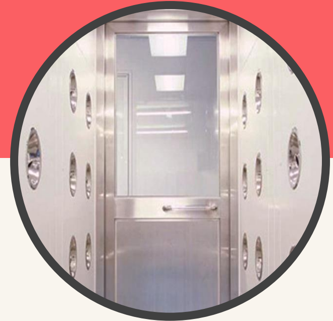
DUST FREE PLANT