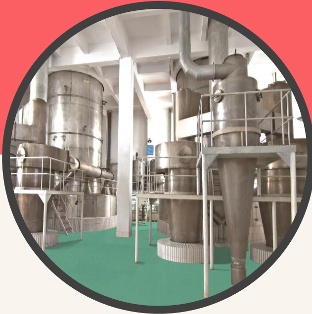
SPARAY DRYING TOWER