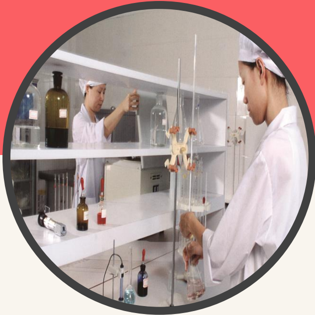
INDEPENDENT AND ELIGIBLE LAB